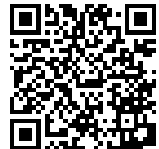
Charter of the Righteous of GariwoNetwork