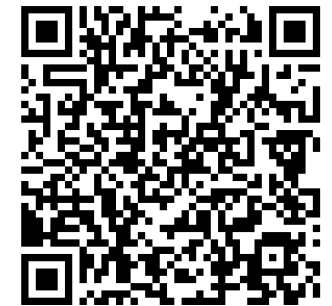
Garden of Milan

During the year we also organize guided tours for schools and citizens.