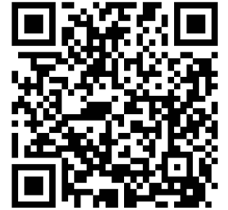
All the Gardens of the Righteous

On our website, you can find the list of the Gardens of the Righteous in Italy and worldwide.