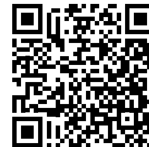
Charter of Responsibilities 2017

GariwoNetwork was launched on 16 November 2017 at the Cariplo Foundation in Milan, with an international conference on the topics covered in the Charter and testimonies on educational projects and on the Gardens of the Righteous in Italy, Europe and the Middle East.