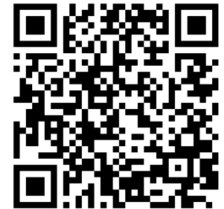
List of the Righteous

To help in choosing the Righteous, while fully respecting the autonomy of the Gardens, Gariwo has created the Charter of the Righteous of GariwoNetwork , with some criteria to identify the exemplary figures to be honored, in line with our orientation. However, Gariwo is always available to the Gardens to evaluate the candidacy together and examine even the most controversial cases.